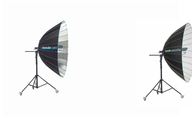
Para 220 FB